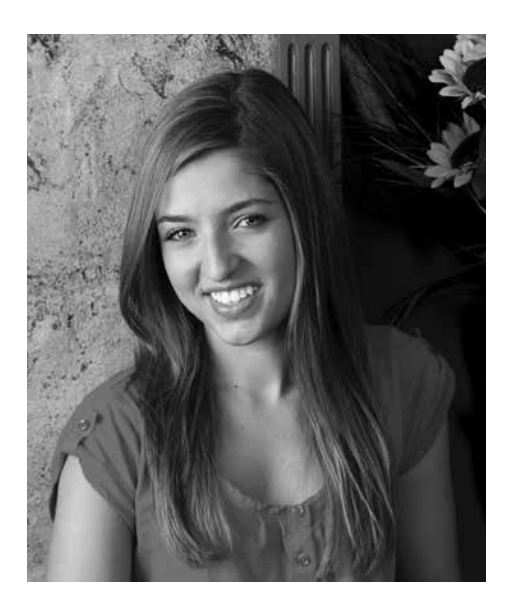
"Those who are happiest are those who do the most for others."

To participate in CFRI's Many Voices ~ One Voice Campaign, please email cfri@cfri.org.