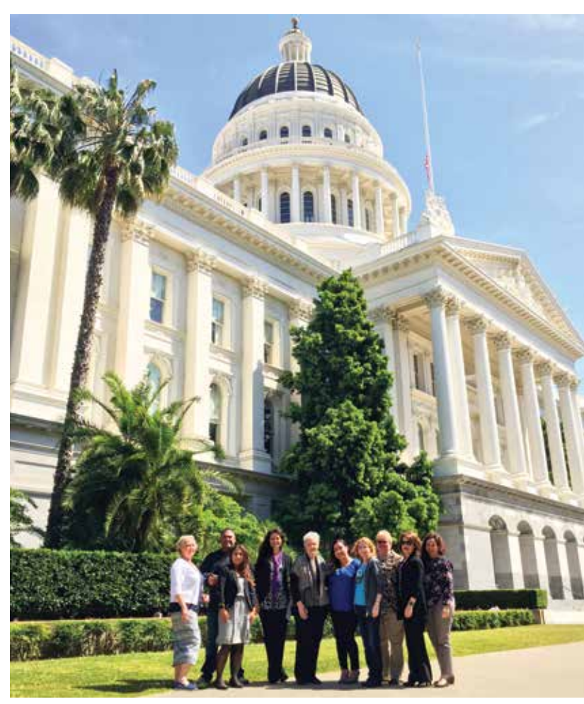
CFRI advocates in Sacramento for declaration of CF Awareness Month in CA