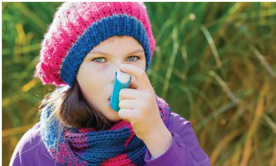
The inflammatory response in the CF lung begins early in life.